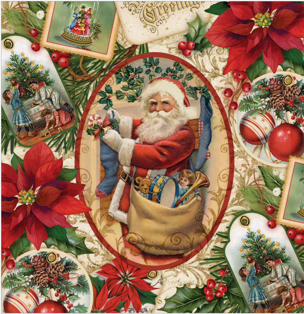
DP24134-12 | Nostalgic Santa | Beige Multi