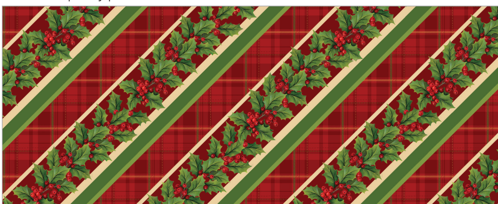
24137-24 | Diagonal Stripe | Red Multi