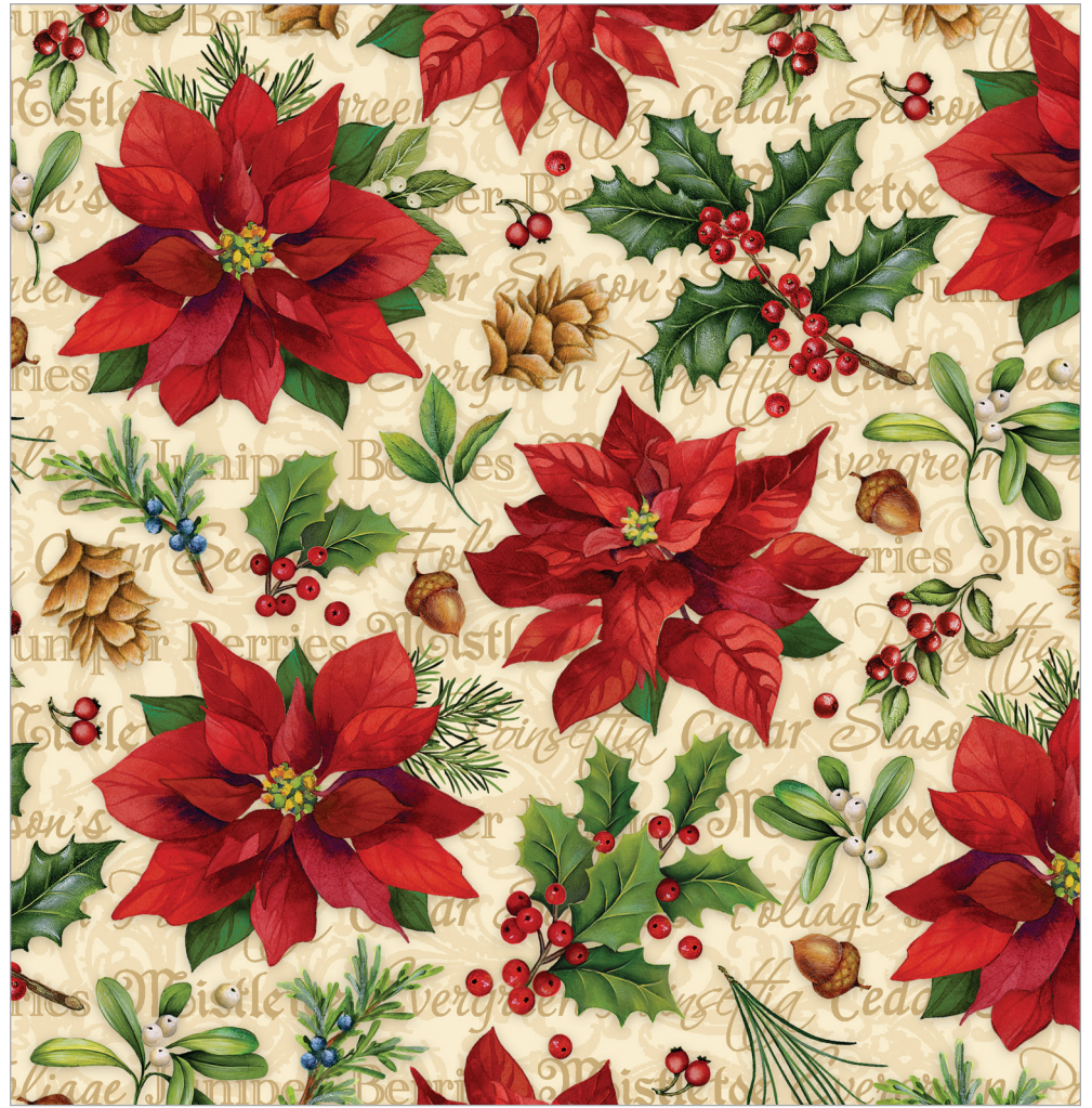
DP24136-12 | Poinsettia and Holly | Beige Multi