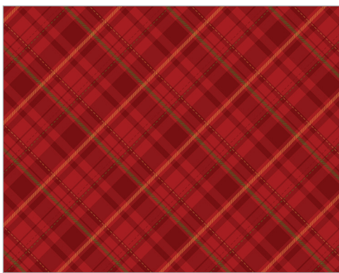
24139-24 | Diagonal Plaid | Red