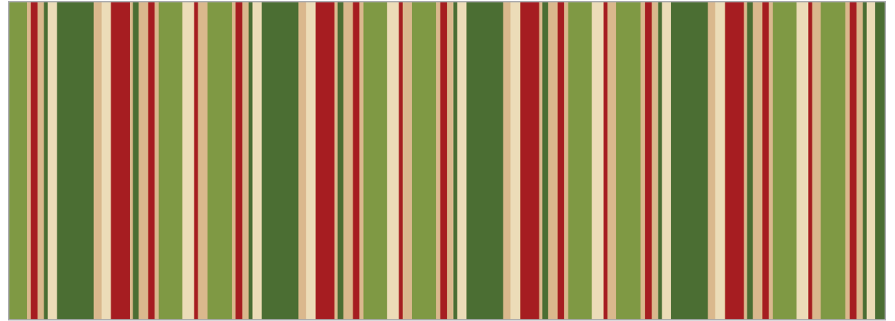
24140-74 | Plain Stripe | Green Multi