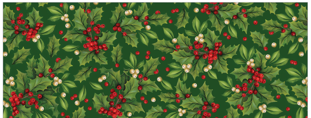
24138-74 | Holly | Green Multi