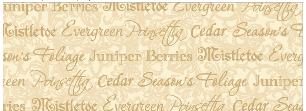
24143-12 | Damask Blender with Words | Beige