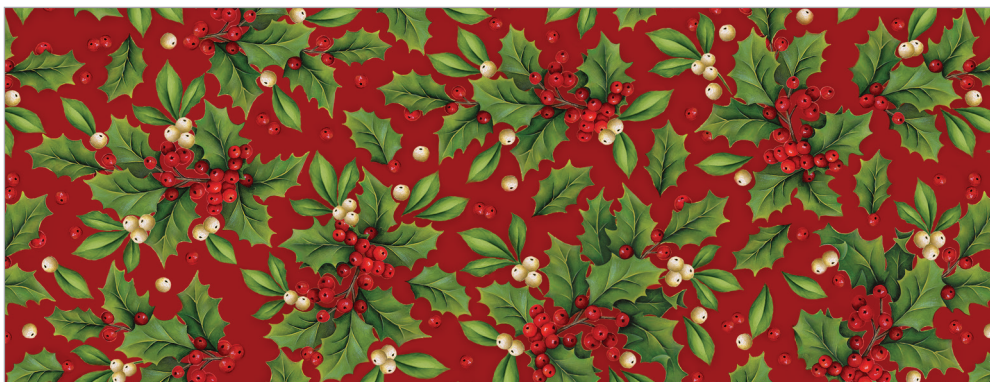
24138-24 | Holly | Red Multi