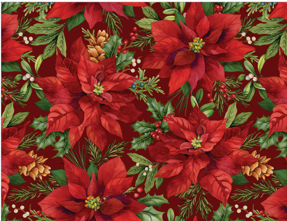
DP24135-24 | Packed Poinsettia | Red Multi