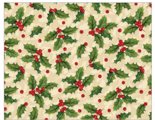
24141-12 | Mini Holly | Beige Multi