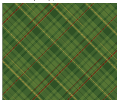
24139-74 | Diagonal Plaid | Green