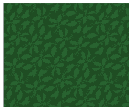
24142-74 | Holly Blender | Green