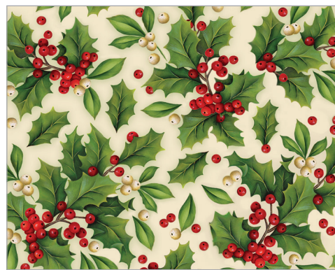
24138-12 | Holly | Beige Multi